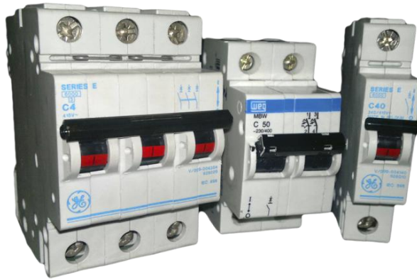
MAGNETOTERMICOS FORMATO IEC